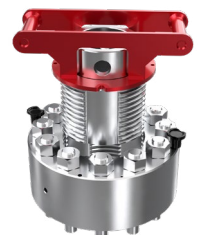
4 Lift and remove lock