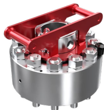
2 Remove magnetic lock pins and store