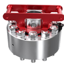
1 Insert lock into ring