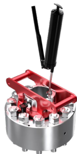
1 Apply grease via SafeLock zerts