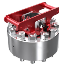
3 Install (2) magnetic pins to lock position