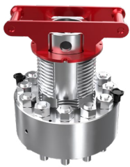
SafeLock OPEN POSITION